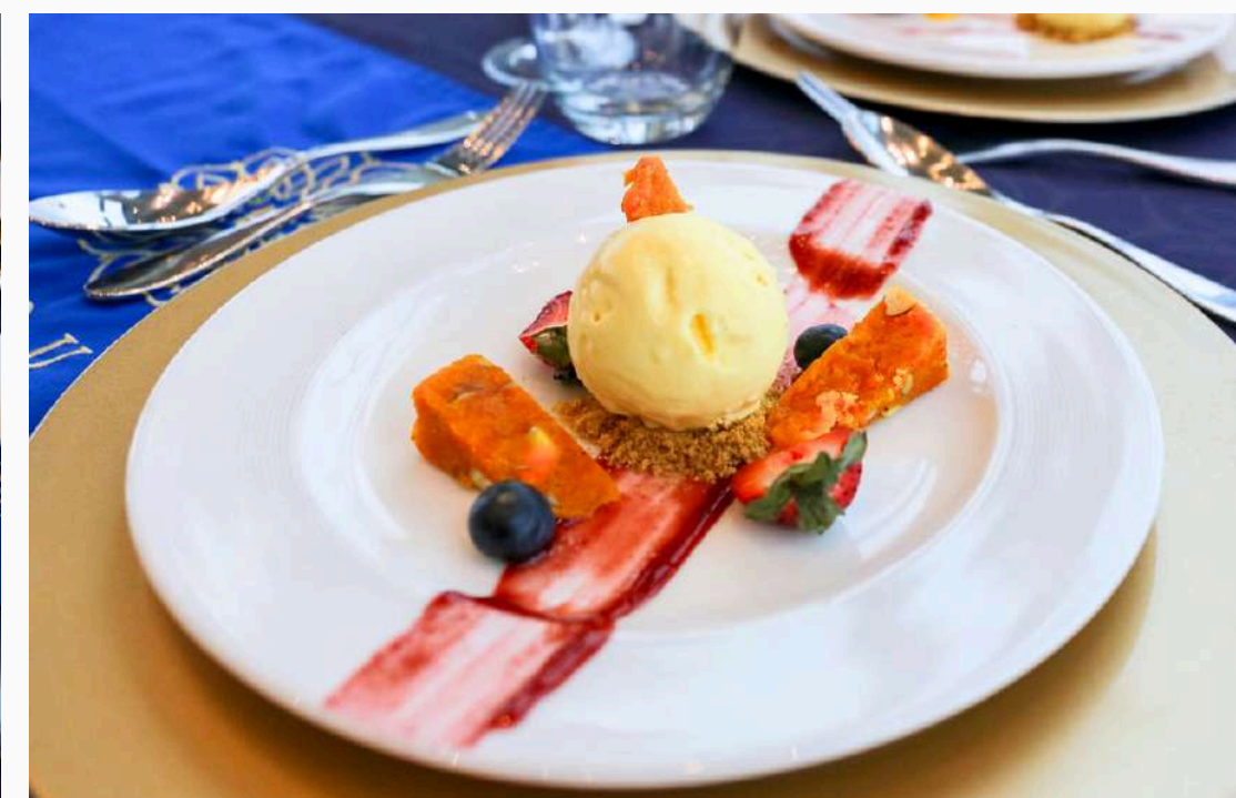
INDUS BANQUETING BRONZE MENU