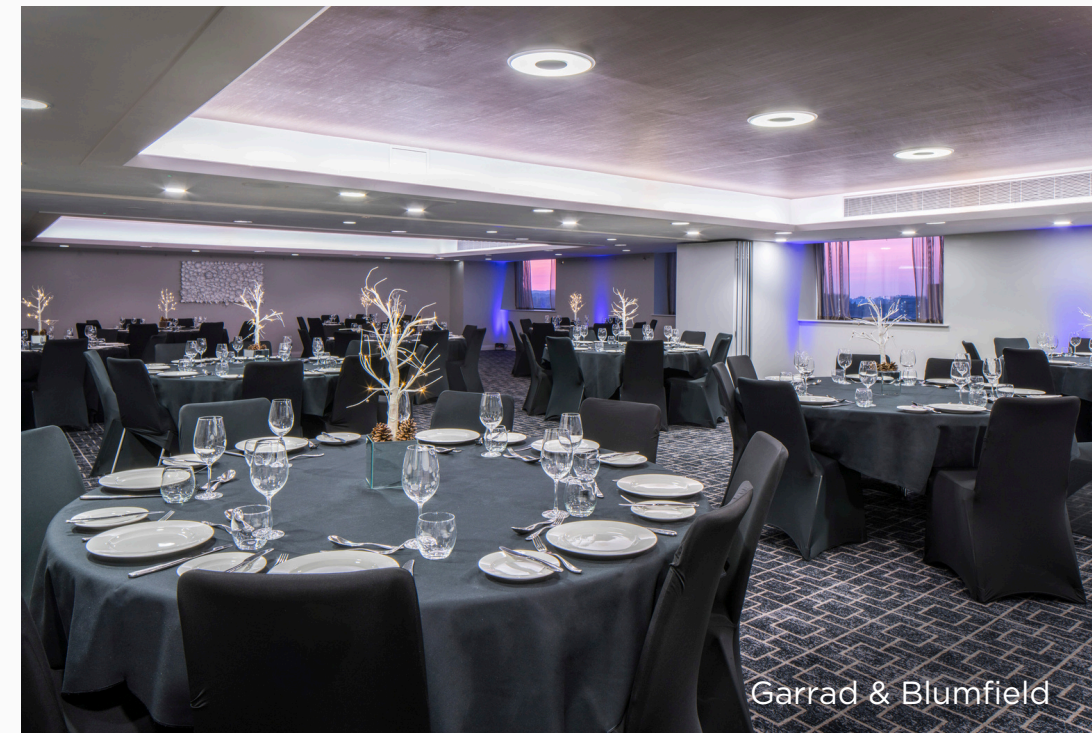
Garrad & Blumfield