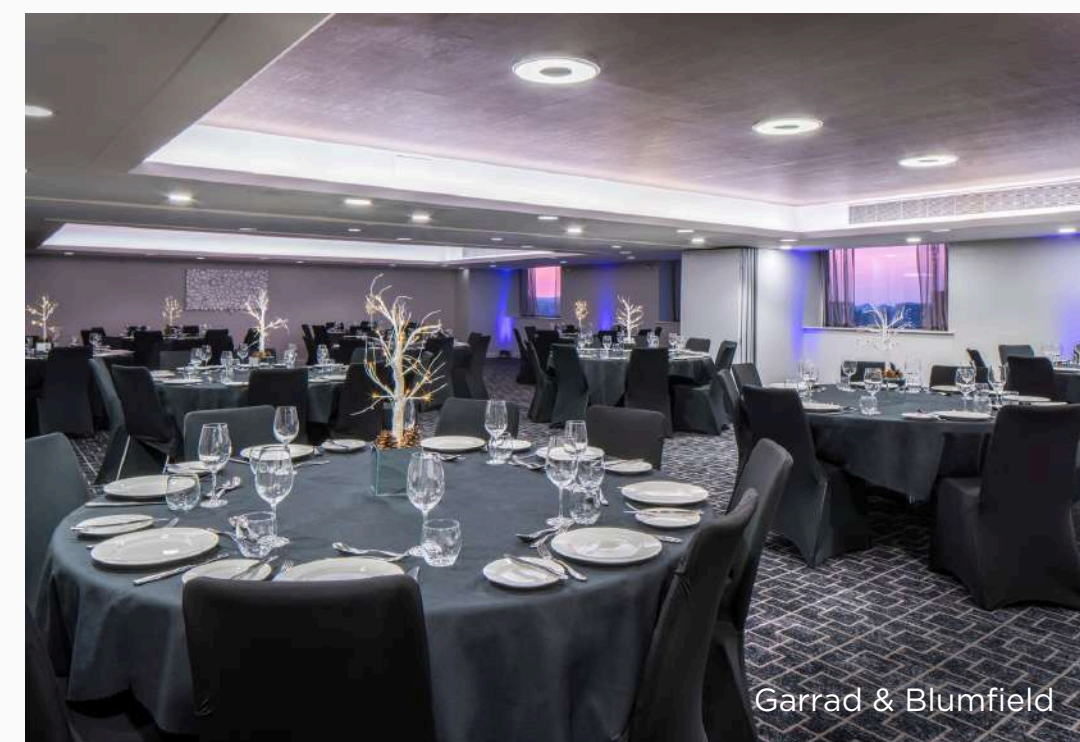
Garrad & Blumfield